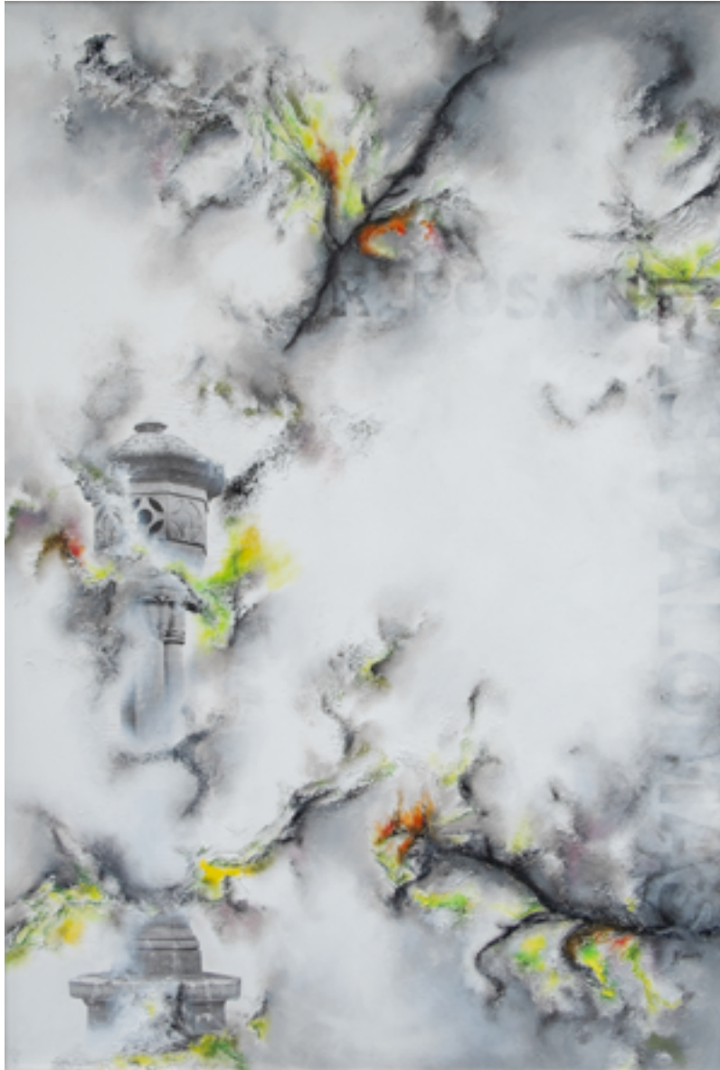
Donde reposan las palomas (where pigeon rest) / Mix media / 120 x 80 cm. / 2018