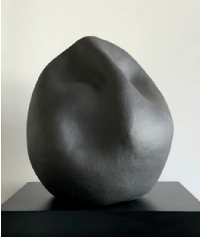
Roca Negra (Black Rock) / White clay / 2021