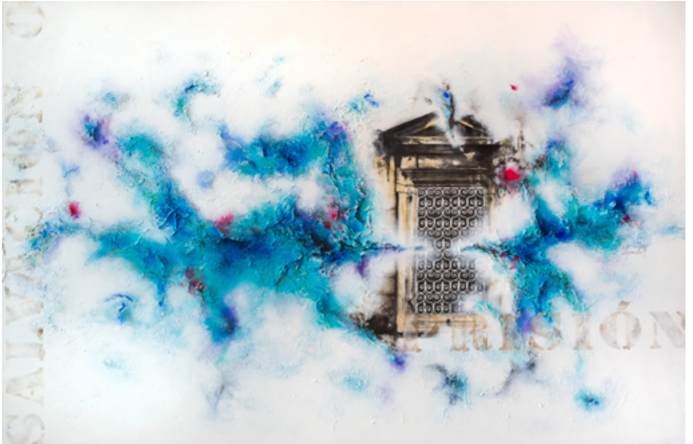
Salvación o Prisión (Salvation or Prison) / Mix media on canvas / 80 x 120 cm / 2019