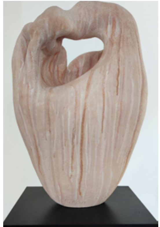
Gran Roca (Big Rock) / White clay with chamota and acrylic / 2022