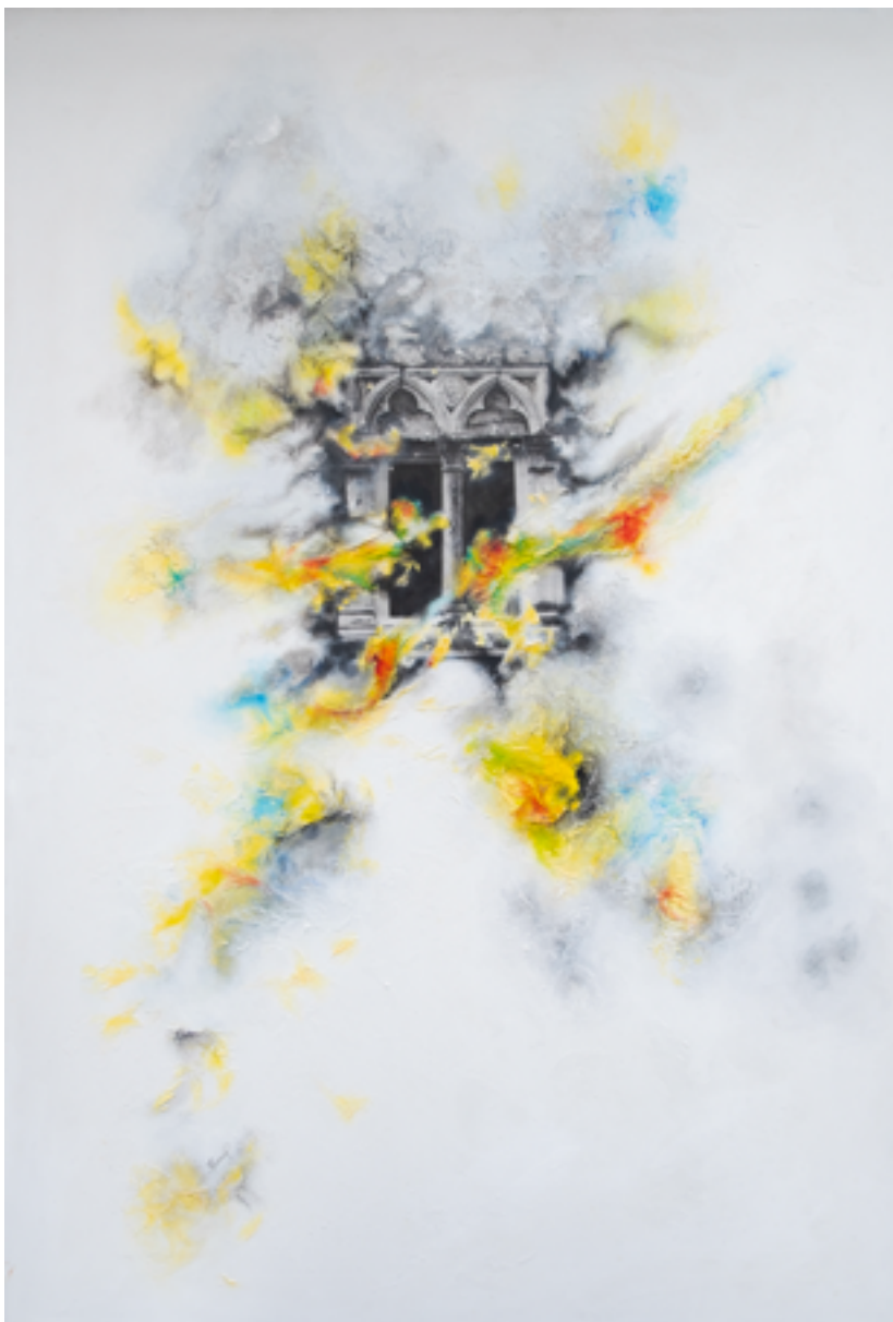
Ventana (window) / Mix media / 150 x 100 cm. / 2018