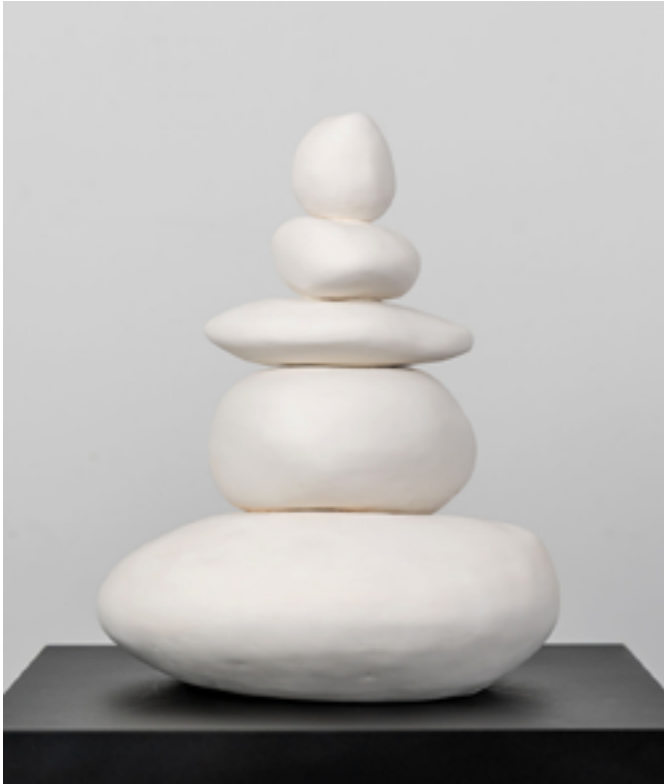
Apacheta blanca I (White apacheta I) / 2019 / White clay.