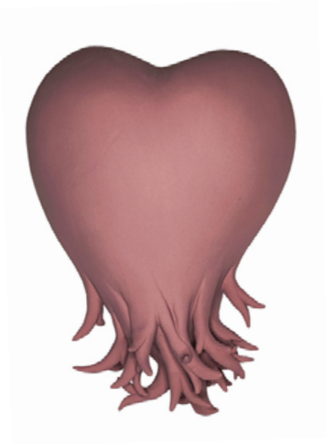
Raices White clay, acrylic.