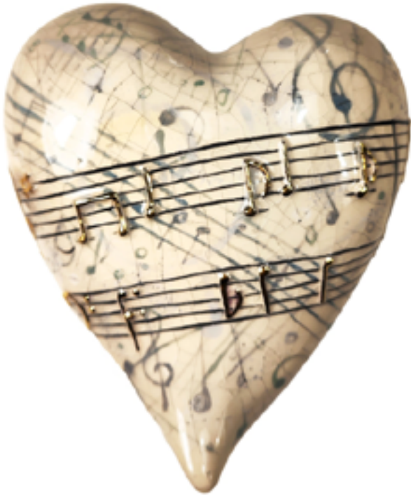
Musical White clay, engobe, transparent glossy glaze and gold