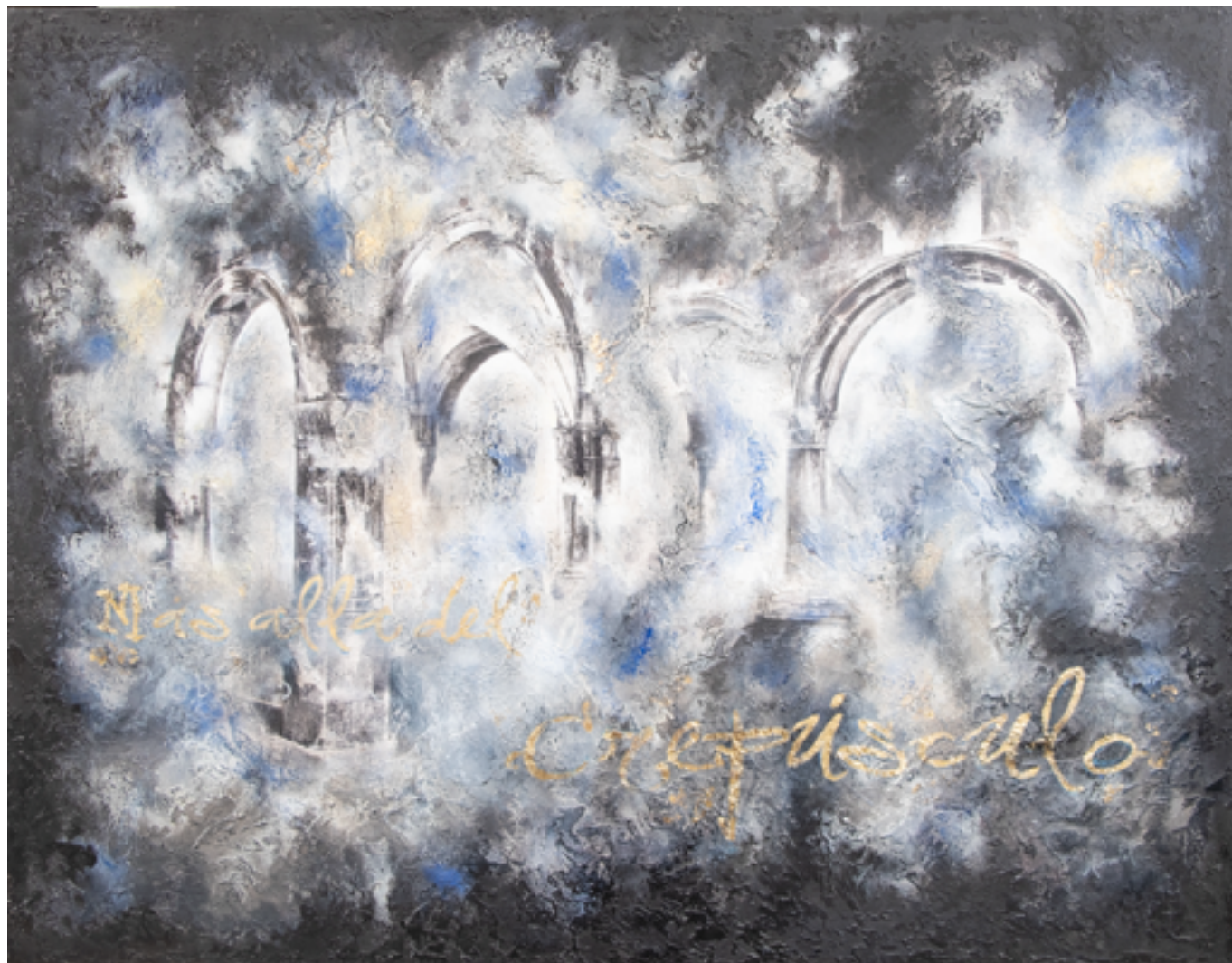
Más allá del crepúsculo (Beyond the twilight) / Mix media on canvas / 90 x 116 cm / 2018