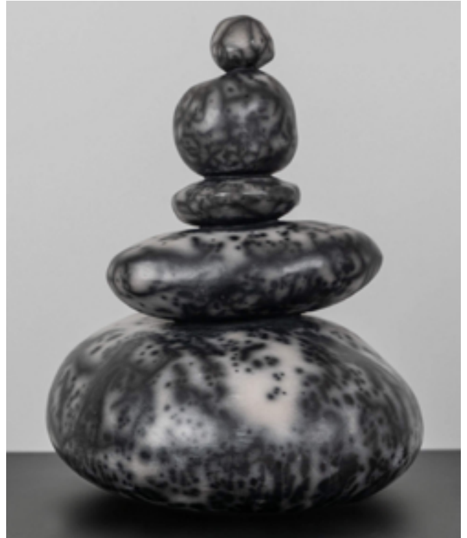
Apacheta Naked / 2018 / White clay.