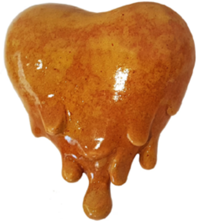
Derretido White clay, orange efect glaze